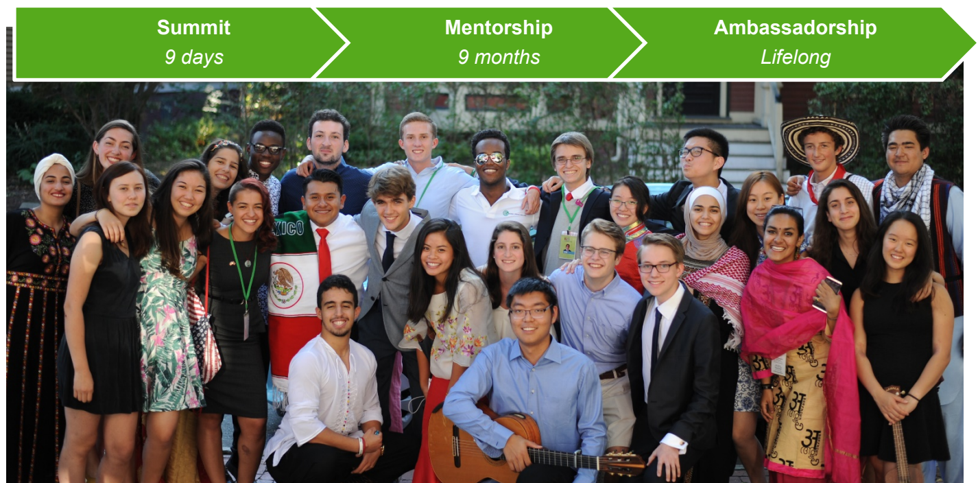
GCI Fellows 2016, some in the national dress of their countries of origin, celebrate the close of the Summit and the start of the nine-month Mentorship

The GCI Fellowship begins at the Summit, a nine-day academically intensive program, where 28 secondary students, known as “Fellows” explore global issues through the lenses of engagement, ethics, excellence and leadership. The Fellows are English-speaking, intellectually gifted and come from a variety of socioeconomic backgrounds and countries.