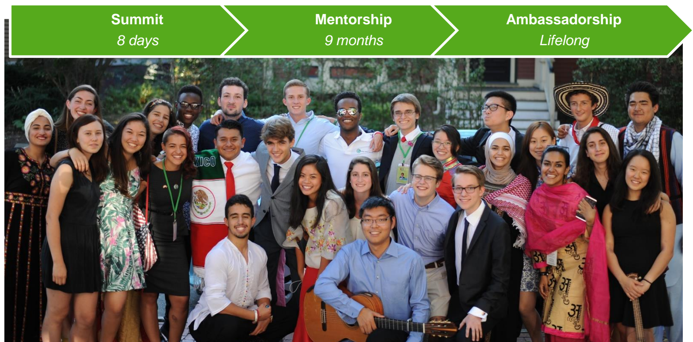
GCI Fellows 2016, some in the national dress of their countries of origin, celebrate the close of the Summit and the start of the nine-month Mentorship

The GCI Fellowship begins at the Summit, an eight-day academically intensive program, where 28 secondary students, known as “Fellows” explore global issues through the lenses of engagement, ethics, excellence and leadership. The Fellows are English-speaking, intellectually gifted and come from a variety of socioeconomic backgrounds and countries.