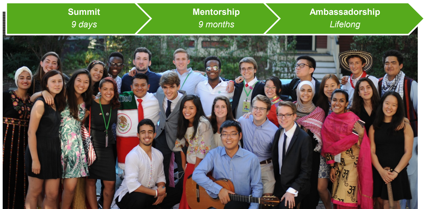
GCI Fellows 2016, some in the national dress of their countries of origin, celebrate the close of the Summit and the start of the nine-month Mentorship

The GCI Fellowship begins at the Summit, a nine-day academically intensive program, where 28 secondary students, known as “Fellows” explore global issues through the lenses of engagement, ethics, excellence and leadership. The Fellows are English-speaking, intellectually gifted and come from a variety of socioeconomic backgrounds and countries.